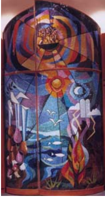
Figure1: David Ascalon, depicting events from the Old Testament, Circa 2000, en.wikipedia.org as at 30 May 2007.